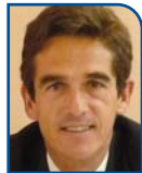
Joan Guanyabens Government of Catalonia Spain